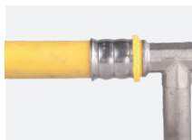
MULTI-LAYER COMPOSITE PIPE