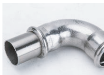
STAINLESS STEEL PIPE