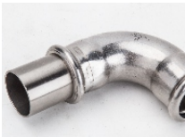
STAINLESS STEEL PIPE